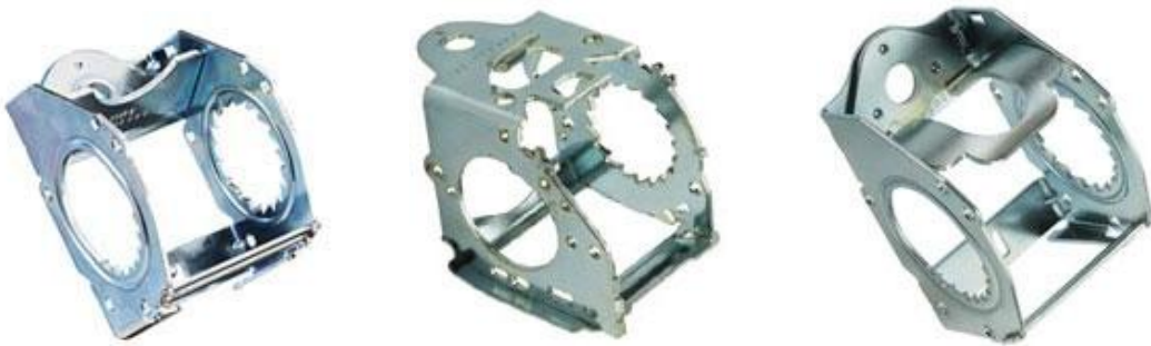
Frames for safety belts