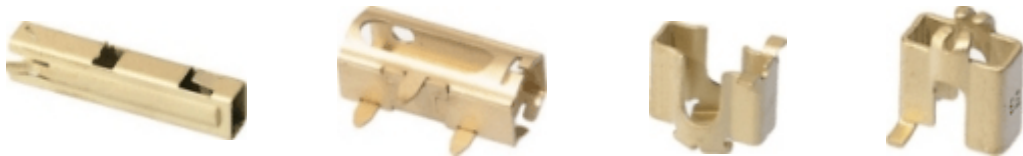
Brush boxes for electric motors