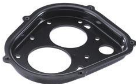
Intermediate housing (transmission)