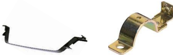
Tank strap / steering column clamp