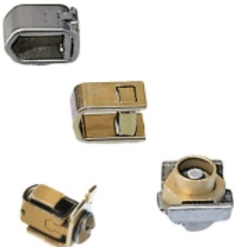
Clamps for electrical installations