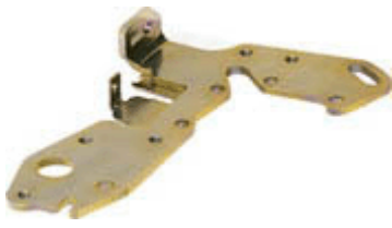
Injector support bracket