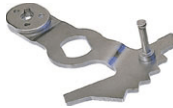
Detent lever for automatic transmission