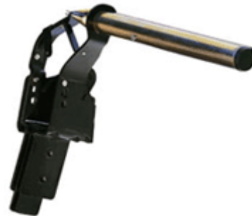
Headrest support with integral safety belt guide