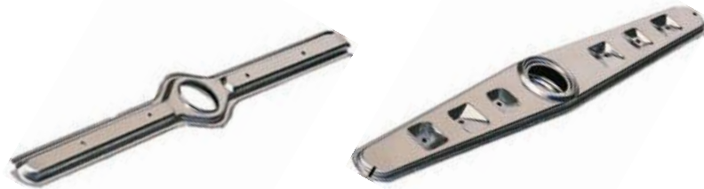
Spray arms for dishwashers