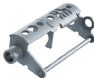
Gates for manual transmissions