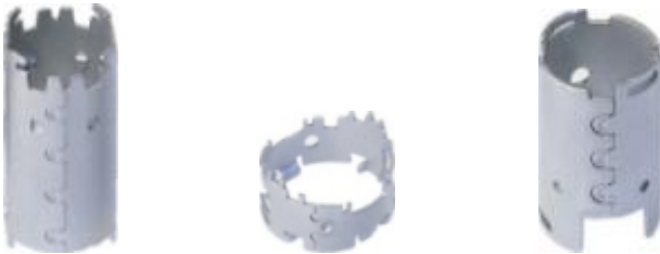
Frames for electric motors