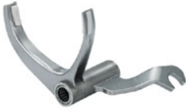
Gear selector fork